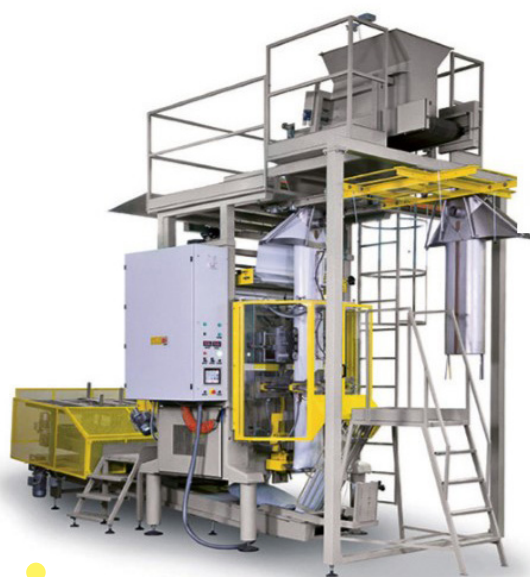
Stainless Steel Form/fill/seal machine Mod. CV4025 with belt doser