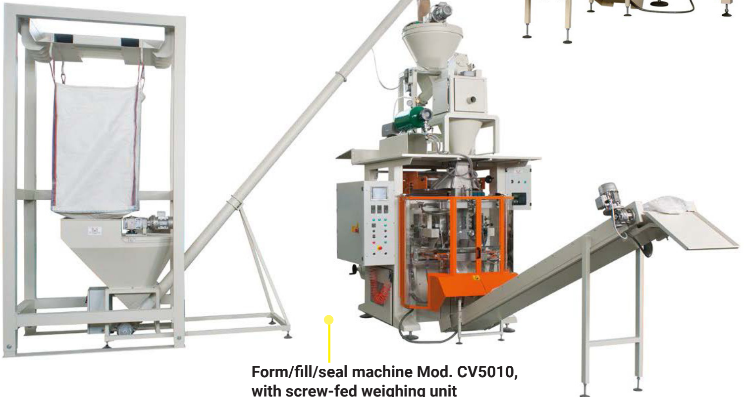
Form/fill/seal machine Mod. CV5010, with screw-fed weighing unit