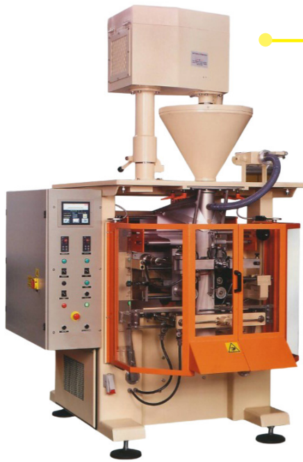
Form/fill/seal machine Mod. CV5010, with cup doser

Automatic form, fill & seal bagging machine for industry