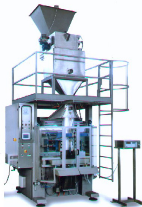
Stainless Steel Form/fill/seal machine Mod. CV4025 with weighing unit