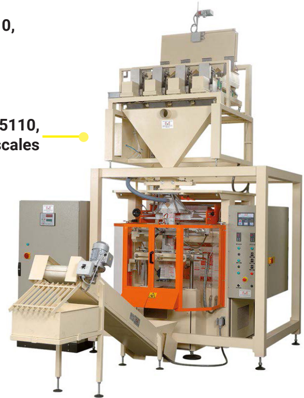
Form/fill/seal machine Mod CV5110, weighing unit with 4 scales