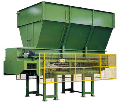
Form/fill/seal machine Mod. CV5080 with belt doser DNSTAR 4 for difficult flowing products (bark, light peat, silage, ...)