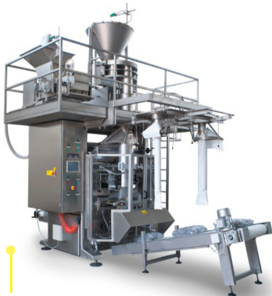
Stainless Steel Form/fill/seal machine Mod. CV4025 with cup doser